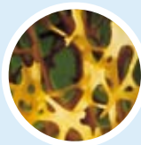
Strong dense bone

Osteoporosis literally means 'porous bones'. It occurs when the struts which make up the mesh-like structure within bones become thin causing bones to become fragile and break easily following a minor bump or fall. These broken bones are often referred to as fragility fractures. The terms 'fractures' and 'broken bones' mean the same thing. Although fractures can occur in different parts of the body, the wrists, hips and spine are most commonly affected. It is these broken bones or fractures which can lead to the pain associated with osteoporosis. Spinal fractures can also cause loss of height and curvature of the spine.