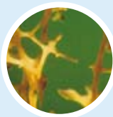
Fragile osteoporotic bone